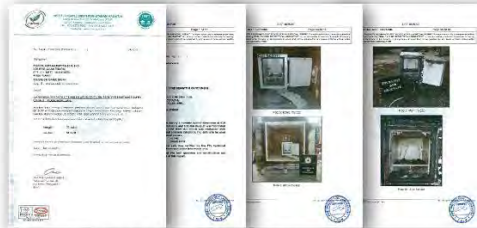
JIS S 1037 : 1989 FIRE RESISTIVE CONTAINERS

This is a convenient and easy to use feature. Employing the use of an 8-bit microprocessor chip, the digital lock system is operated by simple touch. Your secret code can consist of 4 to 6 digits. You can program your own access code in seconds. A time delay lock-out is activated if the false number is entered more than 3 times.