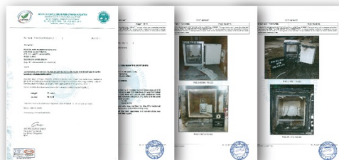
JIS S 1037 : 1989 FIRE RESISTANT CONTAINERS

This is a convenient and easy to use feature. Employing the use of an 8-bit microprocessor chip, the digital lock system is operated by simple touch. Your secret code can consist of 4 to 8 digits. You can program your own access code in seconds. A time delay lock-out is activated if the false number is entered more than 3 times.