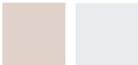
Swiss Mocha White Ice