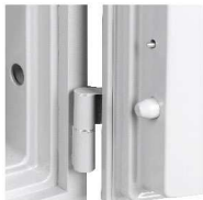
Tongue & Groove