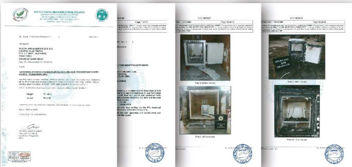
JIS S 1037 : 1989 FIRE RESISTIVE CONTAINERS

This is a convenient and easy to use feature. Employing the use of an 8-bit microprocessor chip, the digital lock system is operated by simple touch. Your secret code can consist of 4 to digits. You can program your own access code in seconds. A time delay lock-out is activated if the false number is entered more than 3 times.